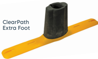
ClearPath Extra Foot