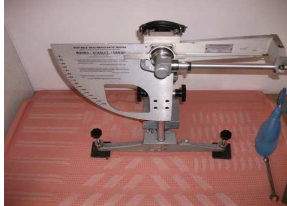
Image 2. Test surface